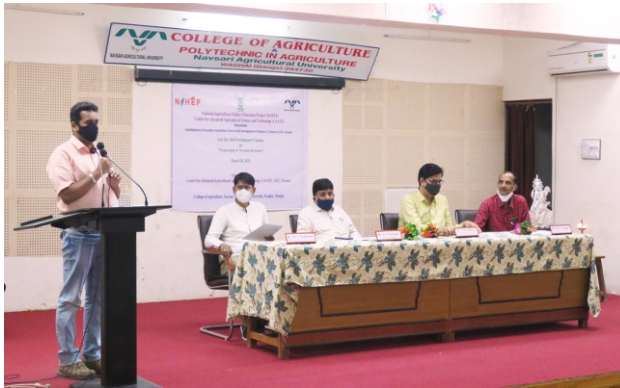
Inaugural Session of the Training

1 st Team of craftsmen involved in learning the structural design of domes structures