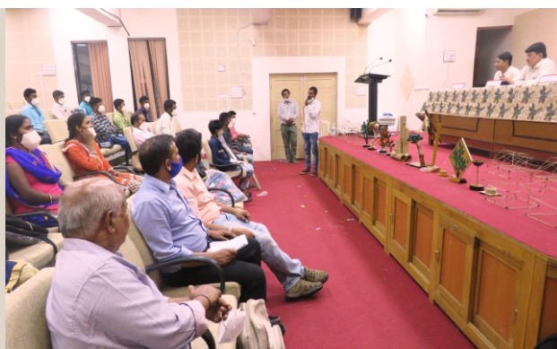
Tribal artisans giving feedback during Valedictory Function