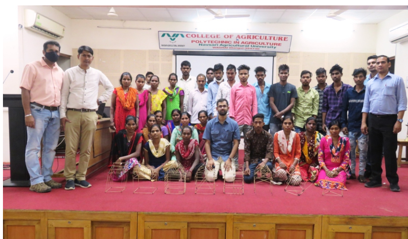
Group photo with Resource Persons, Faculties & Master Artisans